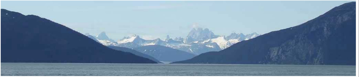
Home: looking toward Taku Glacier (center) and the Taku River while crossing Taku Inlet