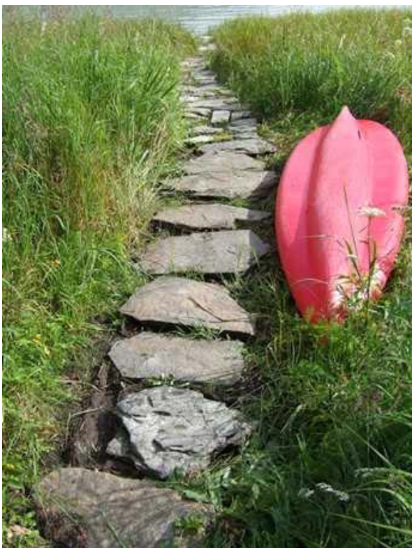
Rock path through the grassy beach

By that time I was pretty tired of brute labor, so I turned my attention to the outhouse, first easily nailing up the plywood siding. Then I finished cutting out the seat cuts in the rafters which I'd started two weeks earlier and nailed pairs of them